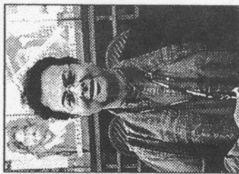
IN HIS PRIME: Rituparno Ghosh

At 41, Rituparno is moving into his prime. Aishwarya Rai and Ajay Devgan will be in his Hindi movie, Raincoat, for which he will work from Calcutta. He has also reached a tentative agreement with Amitabh Bachchan. "If I can make an international standard film in Calcutta, why should I move to Bombay? There is no need," he says.